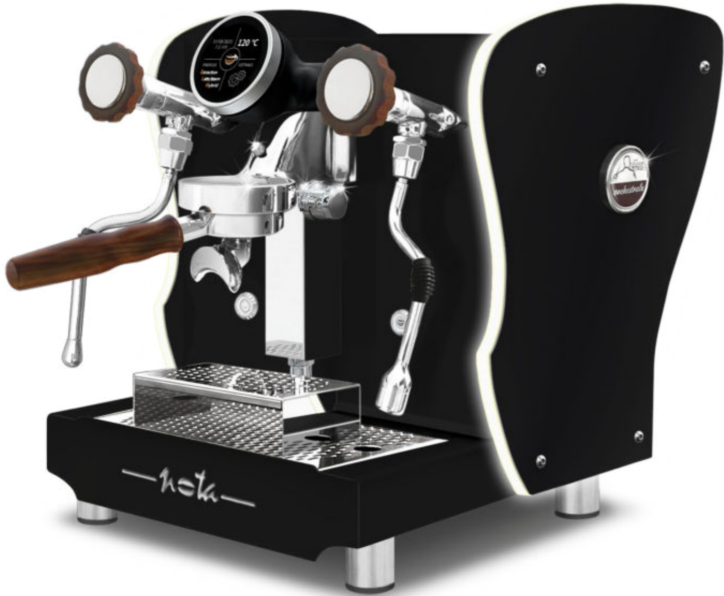
All black nut wood kit