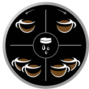
doses + purge