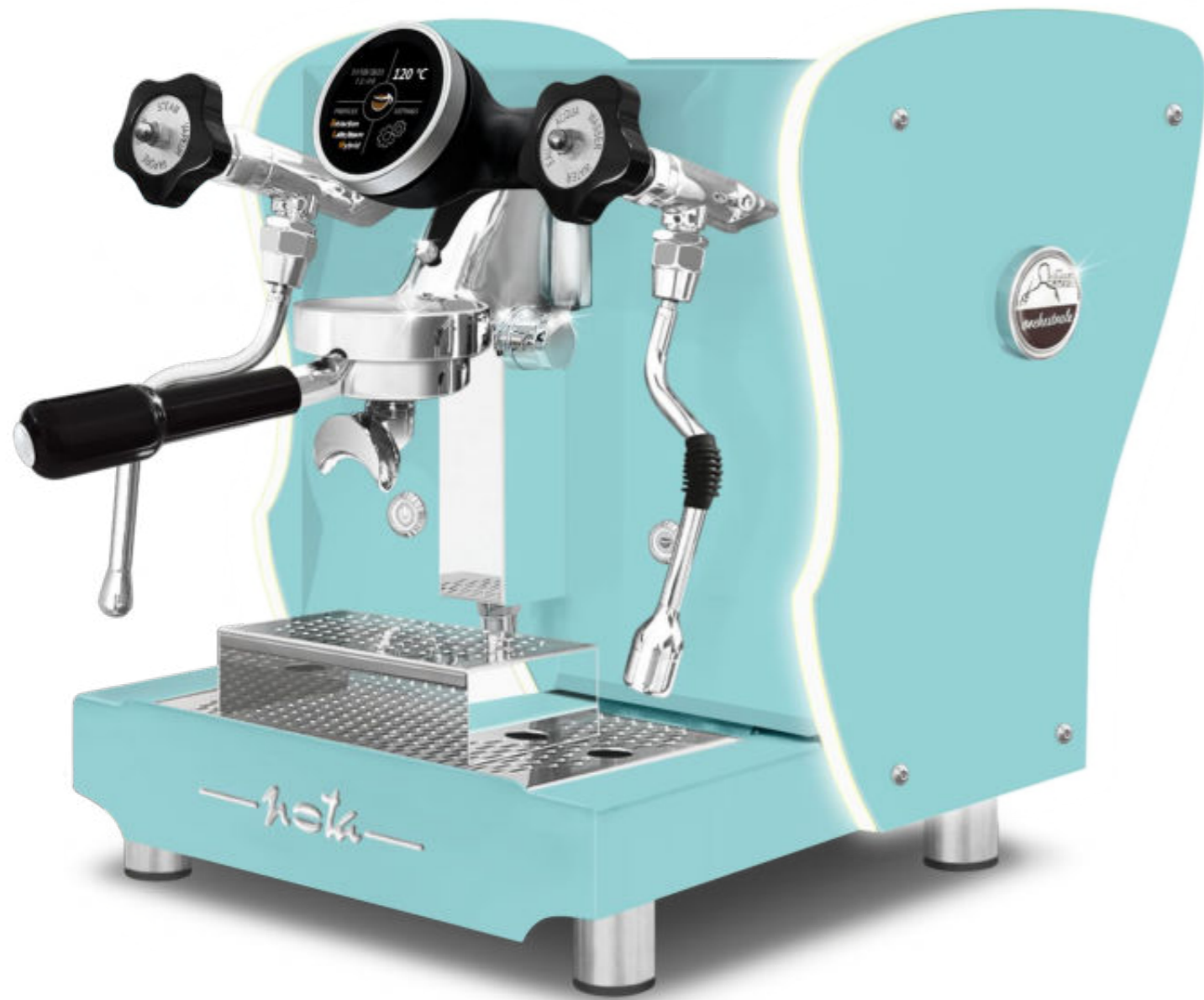
All blue Tiffany