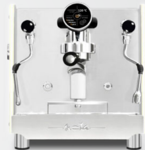
1gr Automatic with joystick taps