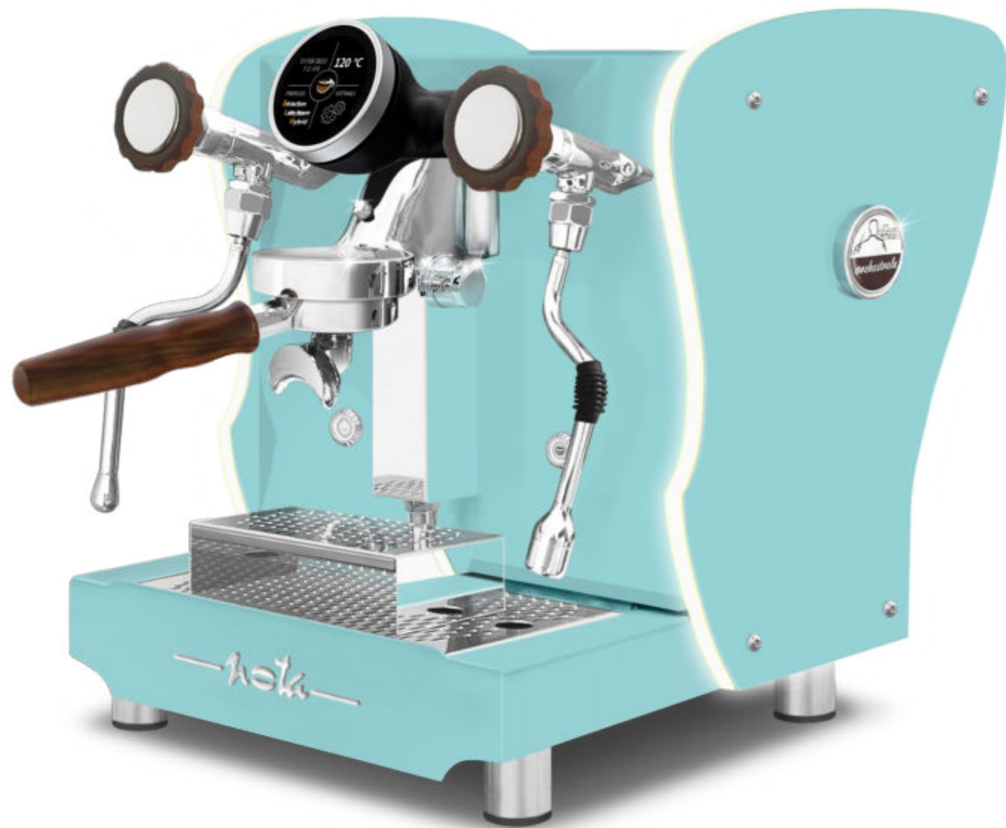
All blue Tiffany nut wood kit