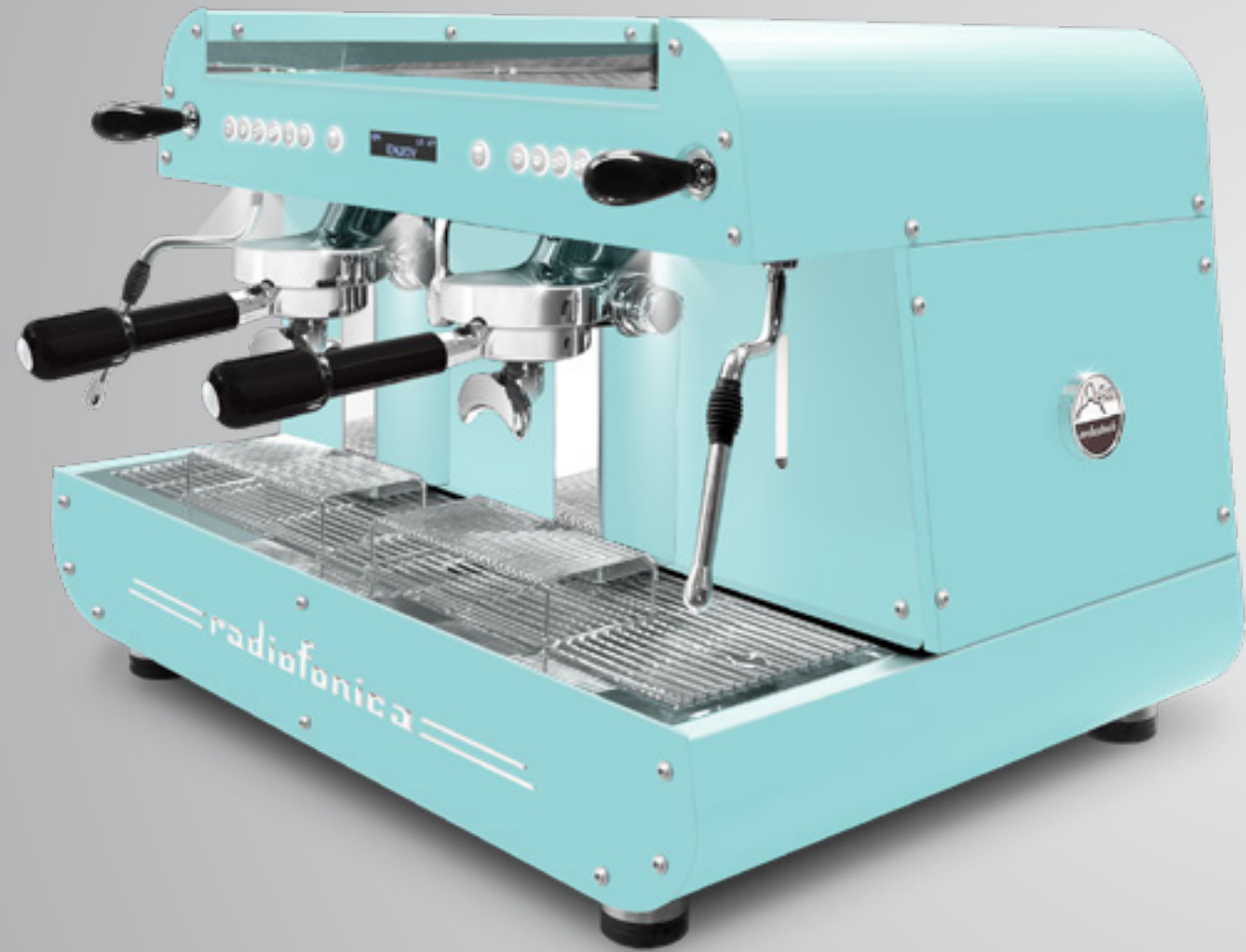
All blue Tiffany