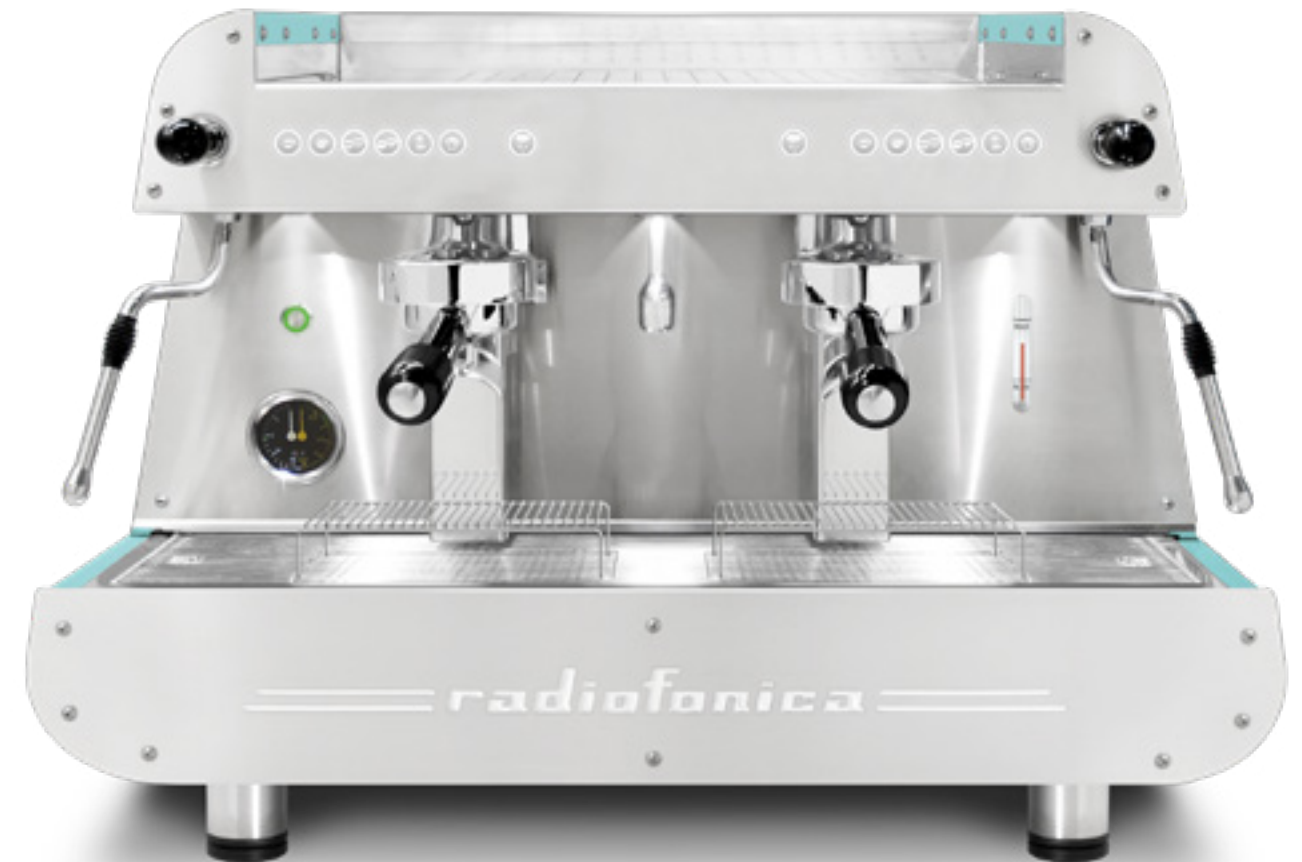
Basic with 1 purge button per group